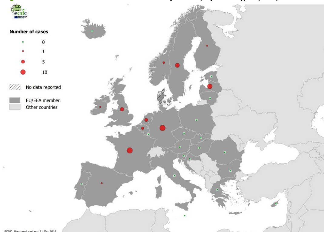
Figure 1. Distribution of confirmed cases of diphtheria, by country, EU/EEA, 2015