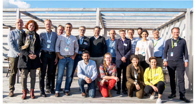
VectorNet's kick-off meeting took place on 17-18 Sept. 2019 in Stockholm, Sweden.

Pan-European mapping of the presence and absence of disease vector provides important information. However, data on the number of vectors, or abundance, is a next step to assess potential pathogen transmissions at a certain time and location. Collecting such comprehensive abundance data is, however, expensive and time consuming because it requires greater standardisation and repeated sampling. VectorNet develops strategies to unlock and interpret abundance and seasonality data. VectorNet also provides scientific support and capacity building on entomological topics to EFSA and ECDC for their activities