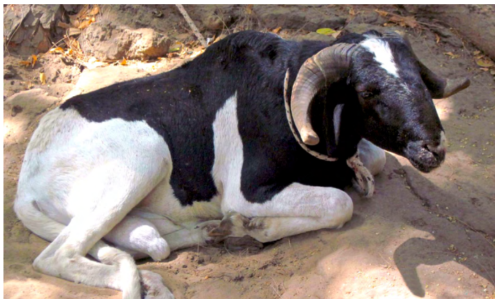
Sahelian ram affected by Rift Valley fever virus

ECDC migrated the data from a semi-relational to relational database to meet new data warehouse standards and to make the data compatible with ECDC's data warehouse. The online VectorTool has been decommissioned and data can be submitted to the data warehouse through the VectorNet vector group leaders (VGLs). For more details please contact the VGLs or send an email to VectorNet_admin@rivm.nl.